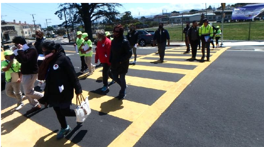
Intrepid walk auditors, April 28, 2022