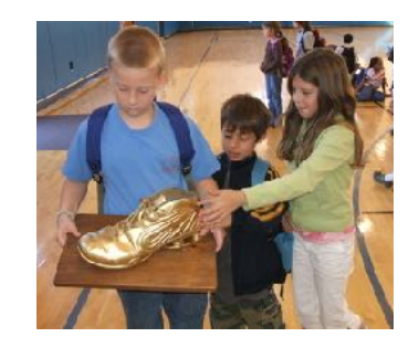
A "Golden Shoe" can be awarded to the class that accumulates the most days walked to school.

be the bus leader. Bicycle trains are the same idea, but typically with two adults so that one can ride at the front of the group and the other at the rear. Some walking school buses are quite informal, with neighborhood residents just collaborating to assure there's always one adult walking with their children. Others are more formal and organized by the school, with background checks and training for walk leaders.