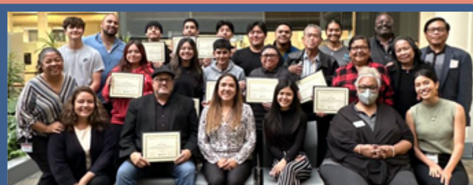
CHOW Collaborative event participants

"This past year, I was able to work closely with an amazing and dedicated team who truly cares about making a positive impact in our communities. I learned so much from each of them and from all the different trainings and meetings we had. "