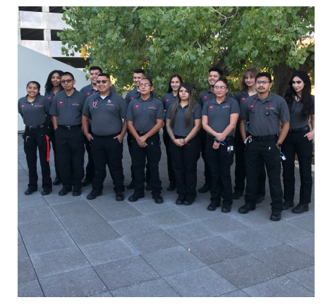
EMS Corps, Albuquerque Pictured: Cohort 1