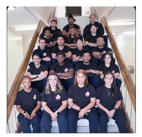
CITY EMT Pictured: Cohort 5

Freedom House 2.0 Pittsburgh, PA Current Cohort: 8