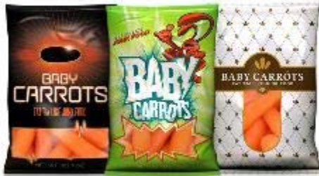
Artist rendering by Crispin Porter + Bogusky

This proposed look for baby carrots packaged in Doritos-like bags and sold in vending machines is part of a new marketing campaign that takes aim at the junk food business.