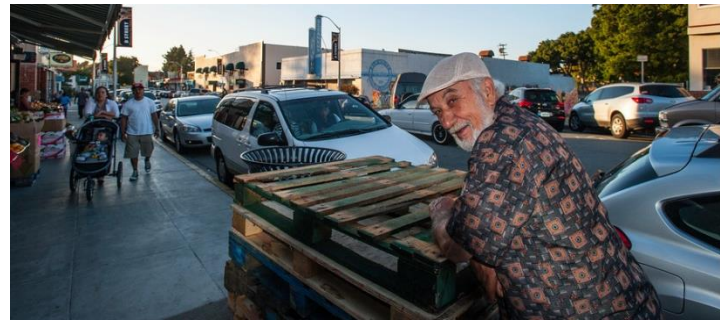
Photo: Store owner on North B Street

Given its challenges and proximity to bustling downtown, some in San Mateo felt that North B Street should be redeveloped completely without a focus on existing merchants. However, the City chose a very different approach — announcing an initiative to dramatically improve North B with a focus on existing merchants and residents. This was prompted by a proposal from an existing local ethnically serving merchant, Mi Rancho Grocery, to expand its operations on the corridor.