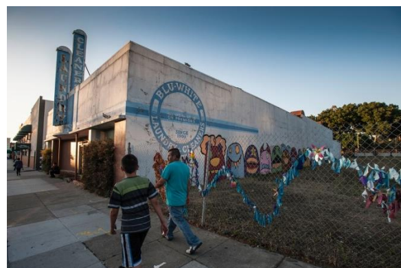
Photo: Walking along North B Street

North B Street is a vibrant, one block strip of largely immigrant-owned small businesses at the northern edge of San Mateo's downtown. On North B, the smells of taquerias, a Peruvian grill, and other restaurants waft past grocery stores, small shops, social service providers, and a community center. Many of these businesses serve the adjacent North Central Neighborhood, a district with much higher rates of poverty (37% vs. 22%) and Latino (46% vs. 27%) and Black (4.3% vs. 2.5%) populations than the rest of the City. 14 While most businesses had been on the corridor for over ten years, almost none