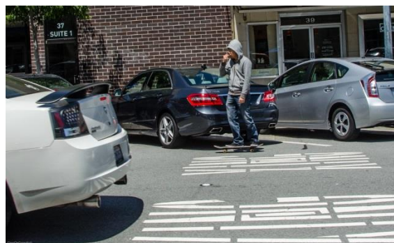
Photo: Skating along North B Street

owned their building, and some had only month-to-month leases—making them extremely vulnerable to displacement. One merchant, for instance, had made $20,000 worth of improvements to a building for which they had no lease whatsoever. While North B is technically downtown, it has been largely overlooked by public and private investment – until recently. A long neglected street, North B has been considered dangerous for pedestrians and drivers. 1 Also, many shopkeepers and patrons have felt unsafe due to public drunkenness.