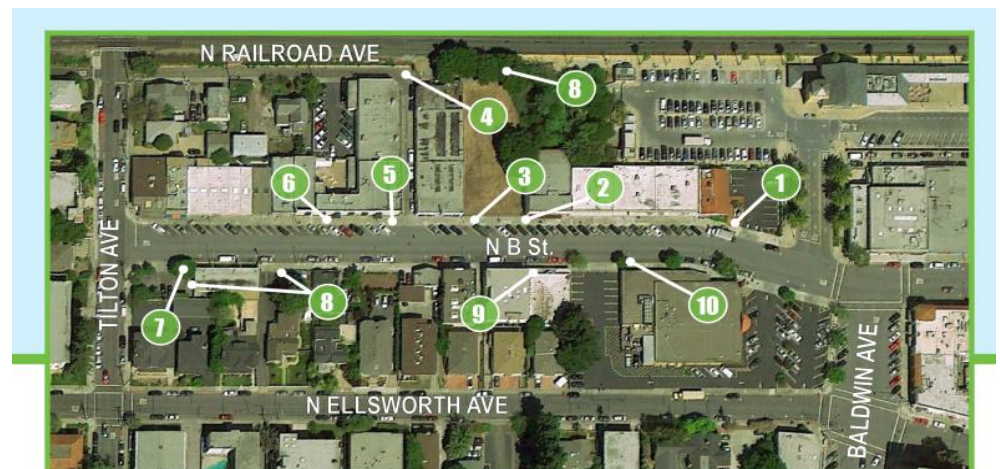
Fig. 2: North B Street Initiatives Map Developed and Distributed by the City Highlighting both Completed and Planned Progress.