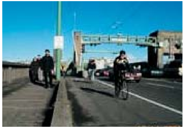
SEATTLE BOASTS OVER 28 MILES OF SHARED USE PATHS THAT FACILITATE WALKING AND BIKING THROUGHOUT THE CITY.

SDOT has now acquired 100% of the rail corridors needed to complete the bike trail system which is now two-thirds complete.