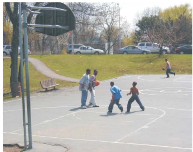
WESTSIDE YOUTH PLAYING BASKETBALL IN THE MILL RIVER PARK.

The health department hired a consultant to adapt the World Health Organization's International Physical Activity Questionnaire (IPAQ) to survey Westside residents. After conducting the telephone survey, the group had responses from 600 individuals. The group decided to present their findings to community residents as well as housing project tenant councils, business people, local political representatives, church and com-