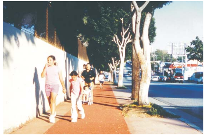
BEFORE: CRACKED SIDEWALKS MADE WALKING AND RUNNING A TREACHEROUS EXPERIENCE. AFTER: A RUBBERIZED PATH SMOOTHES THE WAY FOR JOGGERS AND STROLLING FAMILIES.