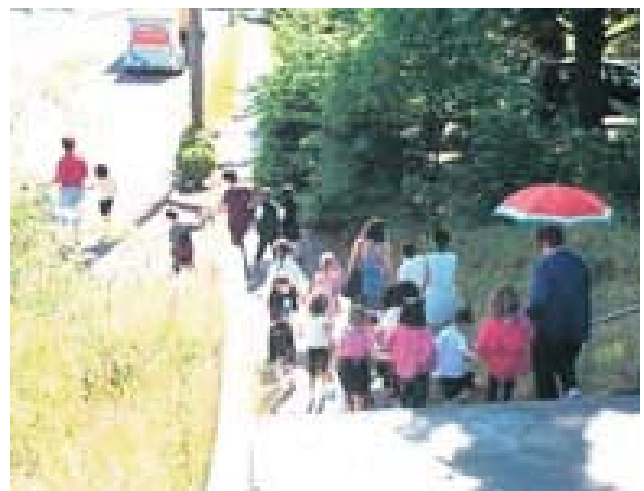
SAFE ROUTES TO SCHOOL ARE A PRIORITY FOR SEATTLE'S PEDESTRIAN PROGRAM.

SDOT also seeks resident input through official neighborhood groups and responds to individual calls from residents about neighborhood plans or specific locations of concern. In cases where members of SDOT staff identify safety-related issues, community members are informed of a proposed change through mailings or community meetings.