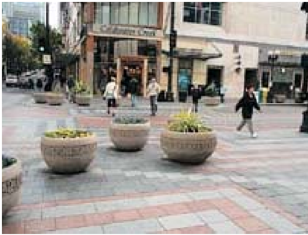
SEATTLE LAW REQUIRES THAT AN ARTS COMMISSION PROVIDE INPUT ON AESTHETICS, LANDSCAPING AND ART FOR ALL PEDESTRIAN PROJECTS.

The pedestrian program promotes walkability by building accessible sidewalk ramps; installing and maintaining school-crossing signs, marked crosswalks, and sidewalks; constructing features that increase pedestrian safety and visibility at curbs and crossing islands; providing walking maps for Seattle's 60 public elementary schools; and identifying and responding to pedestrian safety concerns. The program has a broad purview that includes assessing and maintaining over 700 intersections, implementing both small- and large-scale pedestrian projects, making more than 300 improvements at spot locations throughout the city, and overseeing the gradual implementation of neighborhood plans developed by community residents in the late 1990's. Among the 37 neighborhood plans that were introduced by residents between 1996 and 1998 and adopted through City Council resolution from 1998 to 2000, 35 identified pedestrian issues of paramount importance, sending a strong, clear message to the SDOT that pedestrian safety is a top priority for neighborhood residents.