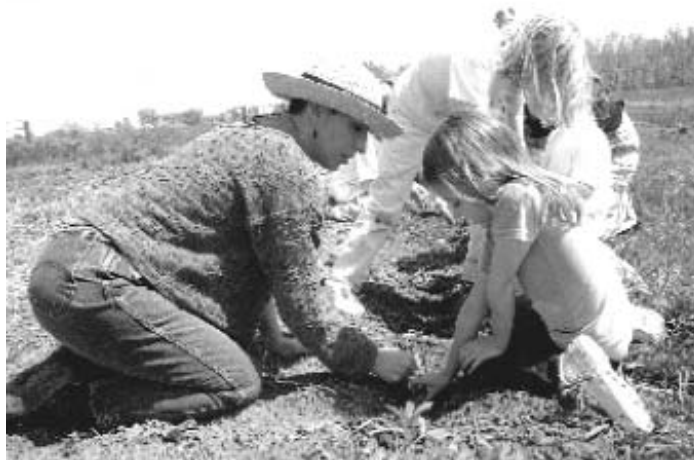
THE CHALLENGING WORK OF GARDENING IS AN INTERGENERATIONAL ACTIVITY, WHERE YOUNG PEOPLE LEARN FROM EXPERIENCED GARDENERS.

Community surveys also support the link between urban garden-