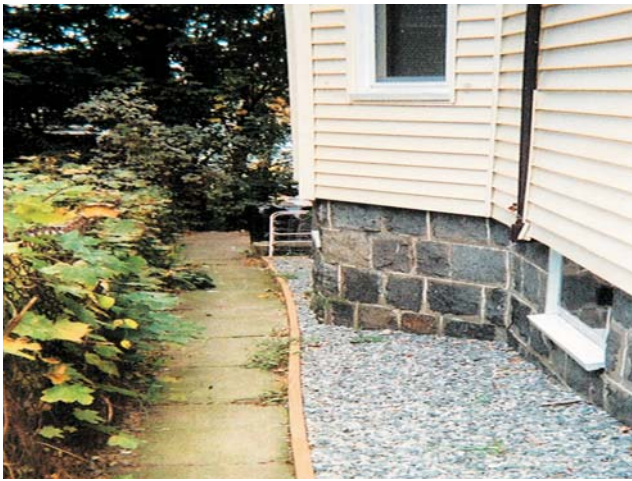
STONE OR BRICK PATHS ARE AN IMPORTANT EPA-RECOMMENDED LEAD ABATEMENT STRATEGY.

development and application of cost-effective landscaping measures to reduce exposure to high lead soil, d) communication with homeowners about design decisions and long-term maintenance, and e) dissemination of project methods to community agencies, local government, and others to encourage program replication.