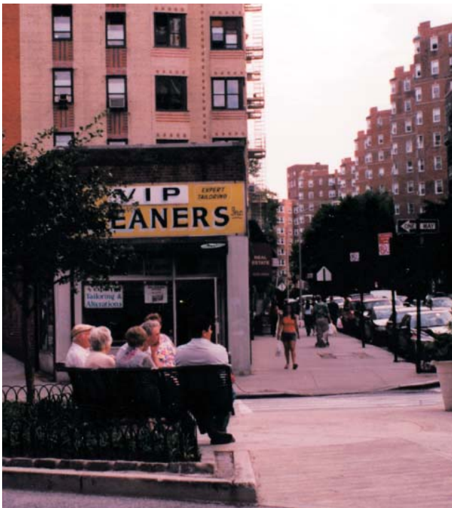
HUDSON HEIGHTS RESIDENTS SIT AND WATCH PASSERSBY FROM THEIR NEIGHBORHOOD RESTING PLACE.

couples. The curve also allows people to walk up to the Trivium, or roll up in a wheelchair and become part of a conversation that is already going on. This is an amazing quality of the semi-circular bench.” Wheelchair users have also benefited from the curb-cuts that were etched into the sidewalks when the park was constructed. This allows them to remain safely on the sidewalk.