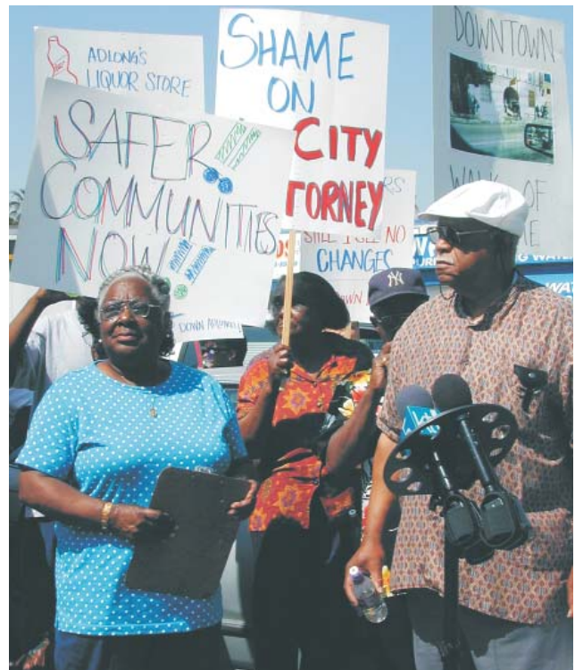
SOUTH LOS ANGELES RESIDENTS PROTEST LIQUOR STORES.

The Community Coalition focuses its efforts in South LA, an area bounded by the Interstate 10 Freeway to the north, Highway 105 to the south, and between Alameda and La Brea Avenues to the east and west, respectively. The 820,000 residents (in an area that is approximately 71.3 square miles) are about 65% Latino