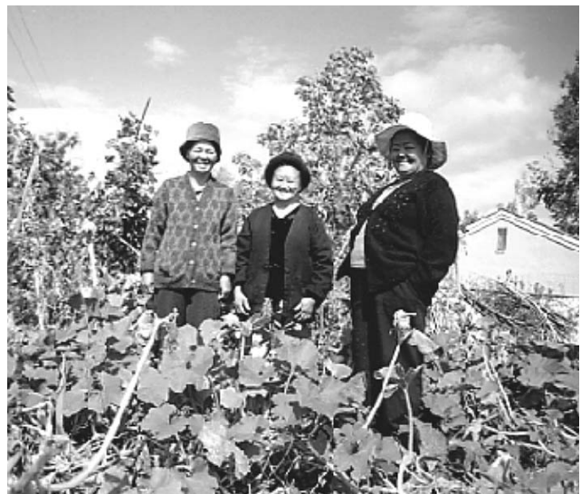
COMMUNITY RESIDENTS BUILD, NURTURE AND MAINTAIN GARDENS WHICH OFTEN SERVE AS NEIGHBORHOOD MEETING PLACES.

Building on its current success, Gardens for Growing a Healthy Community is currently working with Denver Urban Gardens to use geographic information system technology to map out areas and expand work to bring gardens to areas of need. Over the long-term, the collaborative will work with community partners