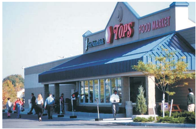
BEFORE CITIZENS ORGANIZED, THE BUILDING WAS AN ABANDONED STORE FRONT. NOW, RESIDENTS HAVE A FULL-SERVICE SUPERMARKET RIGHT IN THEIR NEIGHBORHOOD.

They quickly decided that opening a local co-operative market was not feasible because of the resources needed and the lack of variety that such a store could realistically offer. “What we learned early on was that people wanted a full service supermarket. Basically, they said, we want a market that looks like the suburban supermarket. We’re as good as the people in the suburbs and we deserve a store that will meet all of our shopping needs and look good, too.”