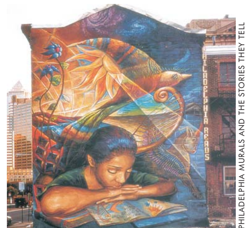
IN SECRET BOOK, 1999.