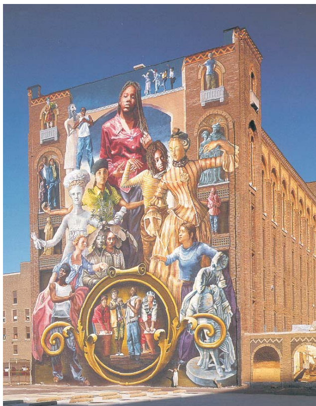
COMMON THREADS: PHILADELPHIA'S TALLEST MURAL OCCUPIES AN 8-STORY WALL.

The value of art for preventing violence, vandalism and graffiti has been hypothesized but not yet formally evaluated. 5 There are numerous examples of public arts and public works programs that require inclusion of art on the basis that public art enhances quality of life, promotes community well-being, increases civic pride, and celebrates regional history. 6 Art has been