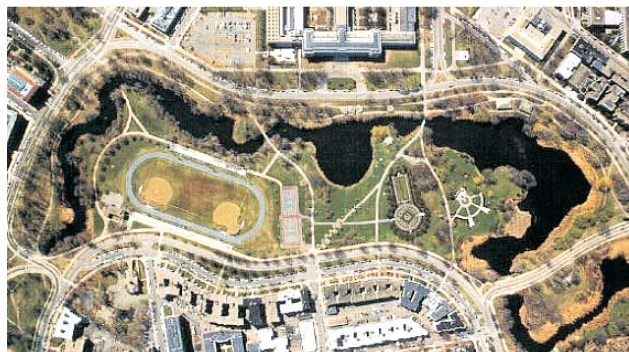
AERIAL VIEW OF THE MUDDY RIVER PARK WITHIN THE EMERALD NECKLACE IN THE FENWAY.

When ten organizations first joined to form the Fenway Alliance in 1977, the group's primary concern was safety. Gradually, as their efforts began to positively impact safety concerns, the group's focus expanded.