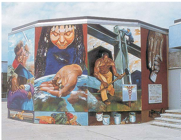
PHILADELPHIA MURALS AND THE STORIES THEY TELL

Keeping up with success is another challenge. As more communities experience the benefits of murals, demand increases. With only a small staff and minimal resources, MAP struggles to meet expectations. “Success is a mixed blessing, a double-edged sword,” said Golden. “We want to ensure fairness by bringing art to different neighborhoods and utilizing the talents of a diverse group of artists.” MAP constantly strives to reach the neighborhoods and youth that need it most and to create art that will make a difference in their communities.