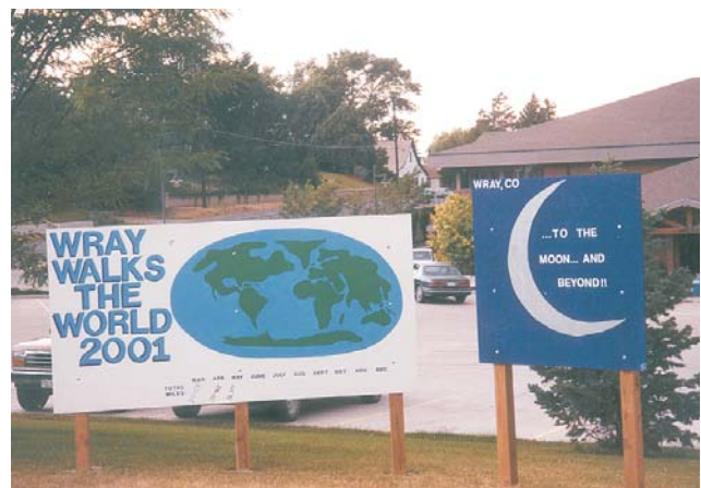
SIGNS CHEER ON WRAY RESIDENTS AS THEY “WALK THE WORLD, TO THE MOON AND BEYOND” FOR A COMMUNITY-WIDE WALKING EVENT.

Data illustrating that physical activity improves cardiovascular health is robust. The Wray results are in line with available research strongly suggesting that improving access to exercise facilities and encouraging activity through community-wide campaigns can increase activity levels and promote fitness among community residents. A review of the published literature conducted by Humpel et al. in 2002 concluded that “the availability of, and access to, cycleways, footpaths, health clubs, and swimming pools were found to be associated with physical activity.” 1 Linenger et al. (despite noted limitations in the study design) found improvements in fitness among military personnel when new equipment was added to a gym, a women’s fitness center was opened and when policies allowed for release time for physical activity. 2 Based on a systematic review of published evidence, the Task Force on Community Preventive Services finds support for strongly recommending the “creation of, or enhanced access to, places for physical activity combined with informational outreach activities” to increase physical activity. 3 The Task Force indicates that successful interventions include “creating walking trails, building exercise facilities, or providing access to nearby facilities”