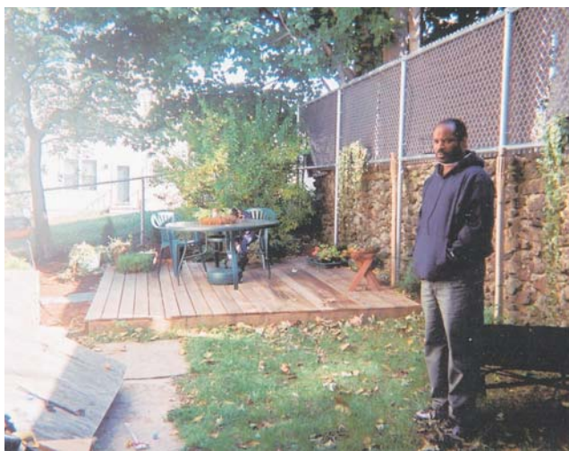
LEAD EXPOSURE FROM SOIL REMAINS A PROBLEM FOR RESIDENTS OF BOSTON'S OLDER HOMES.

In the heart of Boston's "lead belt," children playing in their own yards are unwittingly exposed to lead in amounts that could result in developmental delays, learning disabilities, or behavioral disorders. While achievements in the removal of lead from paint and gasoline have been an extraordinary public health success story, lead-contaminated soil that surrounds older homes remains a significant source of lead exposure that has not yet received widespread attention. A pilot project of the US Environmental Protection Agency's (EPA) Environmental Monitoring for Public Access and Community Tracking (EMPACT) program is working to change that with a project called the Boston Lead-Safe Yard Project (LSYP).