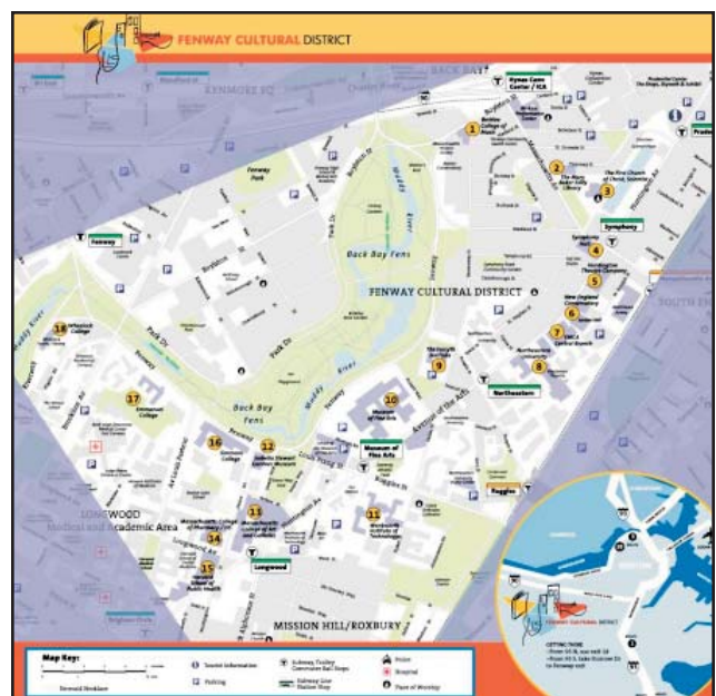
FENWAY AREA, BOSTON, MASSACHUSETTS.

Because its interest lies in bringing more foot traffic to the area to support local businesses and institutions, the Fenway Alliance has not attempted to document increased physical activity as a result of restoration efforts, as they are more interested in increasing admission to, and patronage of, local institutions. However, previous research suggests that improving pedestrian access increases walking activity. In Health