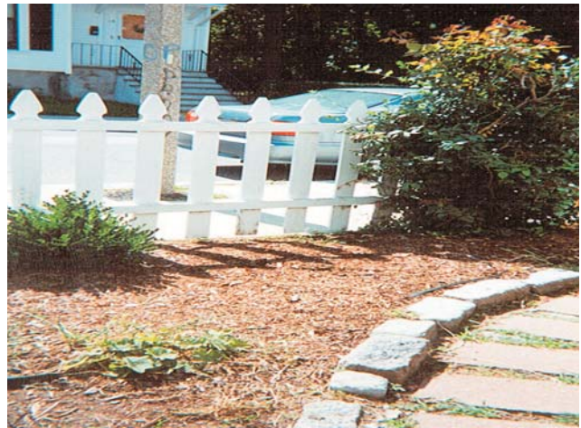
BOSTON'S LEAD-SAFE YARD PROJECT USED LOW-COST TECHNIQUES LIKE GROUNDCOVER TO REDUCE RESIDENTIAL LEAD EXPOSURE.

While achievements in the removal of lead from paint and gasoline have been an extraordinary public health success story, lead-contaminated soil that surrounds older homes remains a significant source of lead exposure.