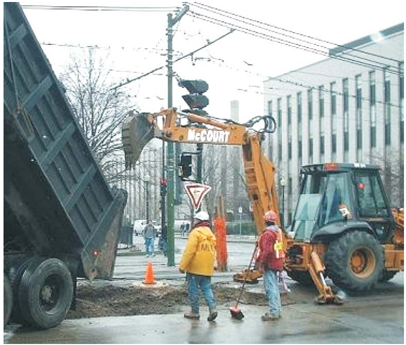
PATRONS VISIT THE MARY BAKER EDDY LIBRARY (LEFT). RENOVATION OF HUNTINGTON AVENUE INCLUDES WIDENING OF SIDEWALKS AND INSTALLATION OF ANTIQUE STREET LIGHTS (RIGHT).

The Fenway Alliance shift in mission came about as representative institutions observed that, despite the beautiful and historic institutions embedded in the Fenway, the surrounding area was simply not very attractive or inviting. Two major thoroughfares funnelled high-speed traffic through the area, creating traffic patterns at odds with pedestrian and bicycle safety. By the late 1980's the Fenway Alliance began efforts to increase pedestrian traffic by improving both the walkability and aesthetics of the area. Today's Alliance is made up of 22 member institutions.