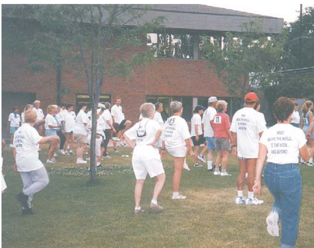
A COMMUNITY EVENT PROMOTES ACTIVITY IN THE COURTYARD OF THE WRAY REHABILITATION AND ACTIVITY CENTER.