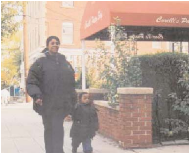
STAMFORD RESIDENTS ENJOY WALKING IN THEIR OWN NEIGHBORHOOD.