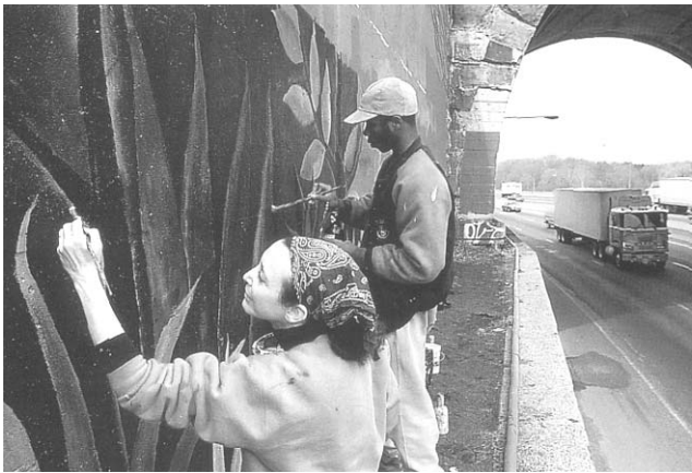
PHILADELPHIA MURALS AND THE STORIES THEY TELL