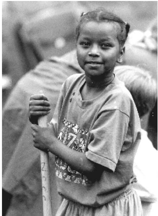
CHILDREN DEVELOP A PASSION FOR GARDENING WHILE GETTING ACTIVE AND MASTERING NEW SKILLS TO GROW FRESH PRODUCE.

Gardeners collectively assume responsibility for improving their own neighborhoods and cultivating a sense of pride in their surroundings while growing fresh, organic food close to home.