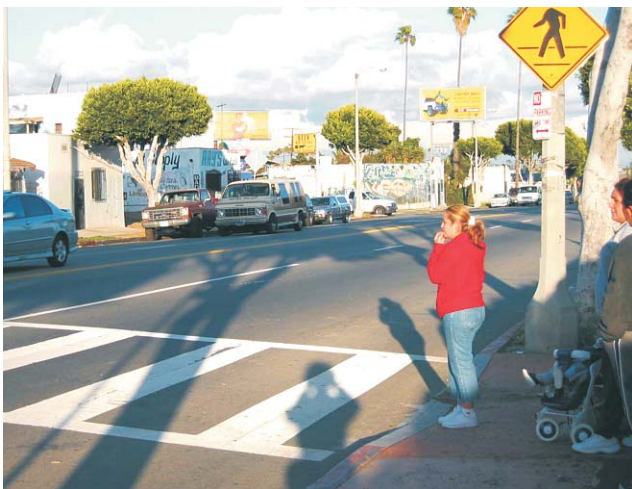
WIDE STREETS AND HEAVY TRAFFIC FLOW SURROUNDING THE EVERGREEN JOGGING PATH CAN MAKE CROSSING A DAUNTING TASK FOR PEDESTRIANS.