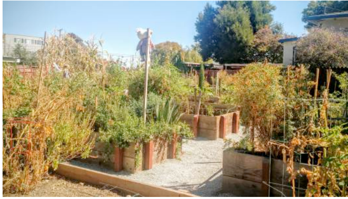
St. Francis Center Community Garden #1