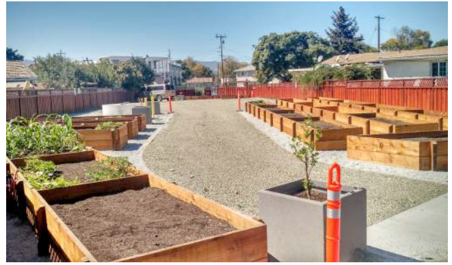
St. Francis Center Community Garden #2, (currently under construction)

The current food environment in North Fair Oaks which makes it easy to purchase unhealthy, low quality foods at affordable prices impacts the overall health of the residents.