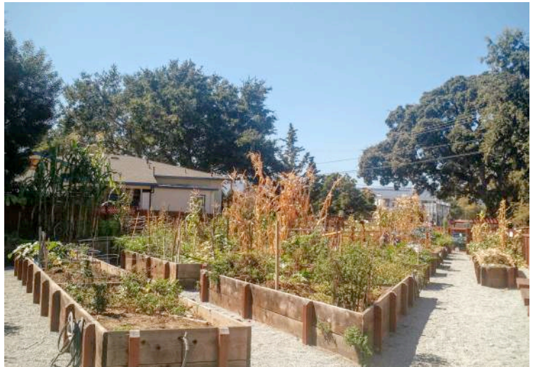
St. Francis Center Community Garden, North Fair Oaks