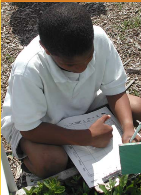
Observing, recording, analyzing.

For more information, contact garden@aginnovations.org . Additional school garden resources are available at http://www.getthehealthysmc.org/ .