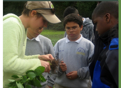
Hands-on examination and learning.