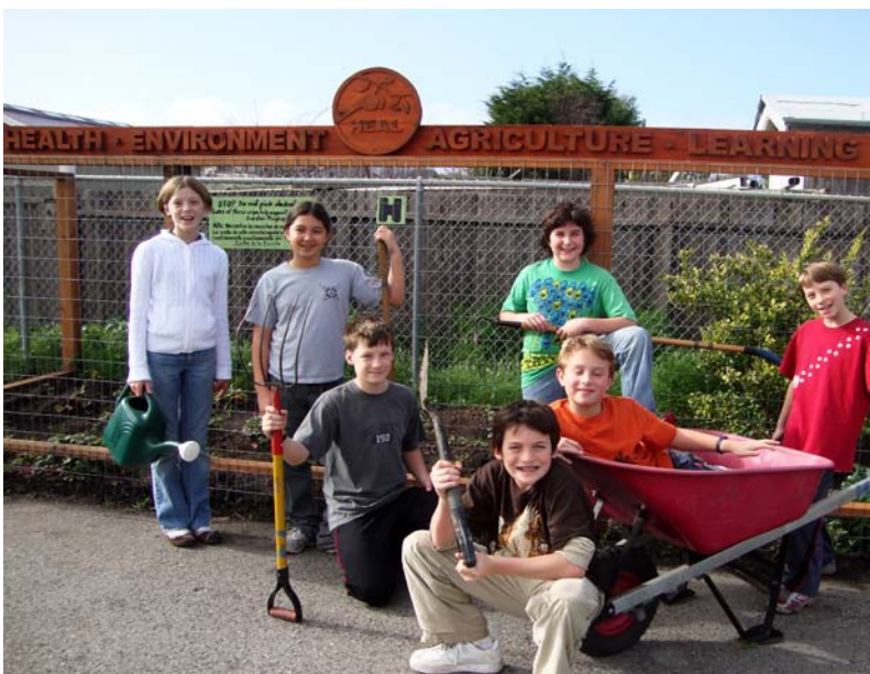
Teamwork and physical activity.