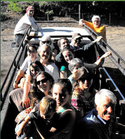
San Mateo County Food System Alliance.