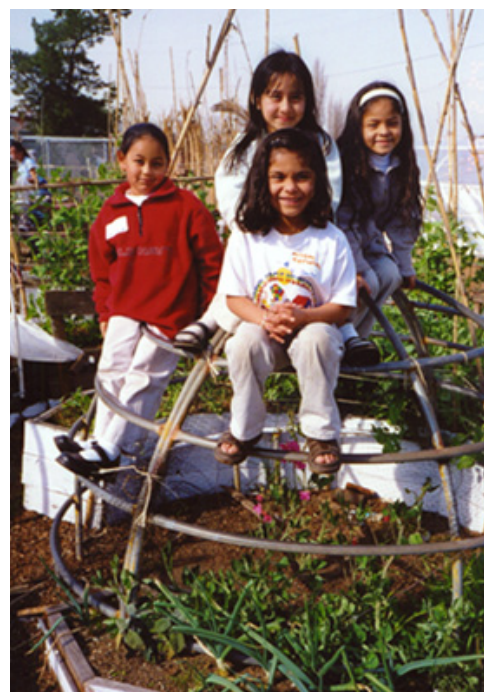
Gardens provide a space for fun and learning.

“The San Mateo County Health Department believes that every child in our county should have the experience of eating something that they themselves planted. When this activity happens in a school garden setting and with an associated curriculum, it has positive impacts on educational achievement, individual and family health, and the environment.”