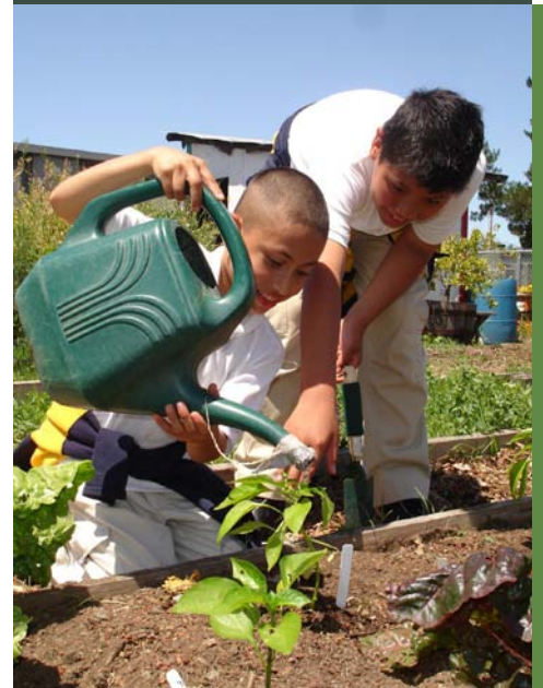
Learning and mentorship.