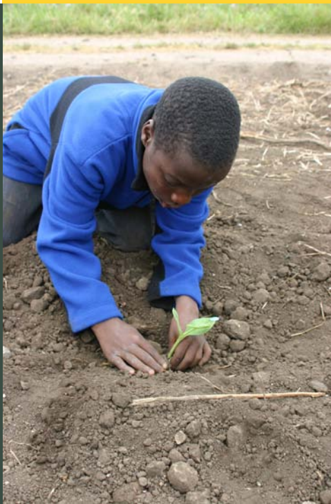
Connecting to the earth.