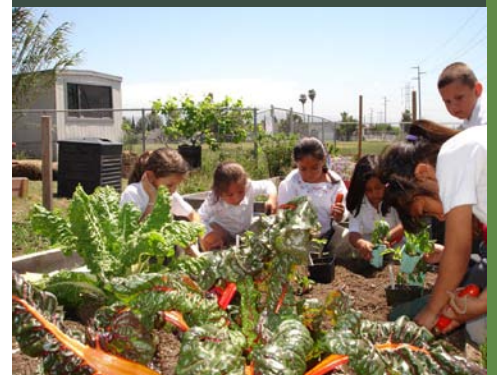
Working with rainbow chard.